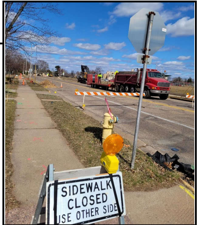
Lincoln Street at Chestnut Street