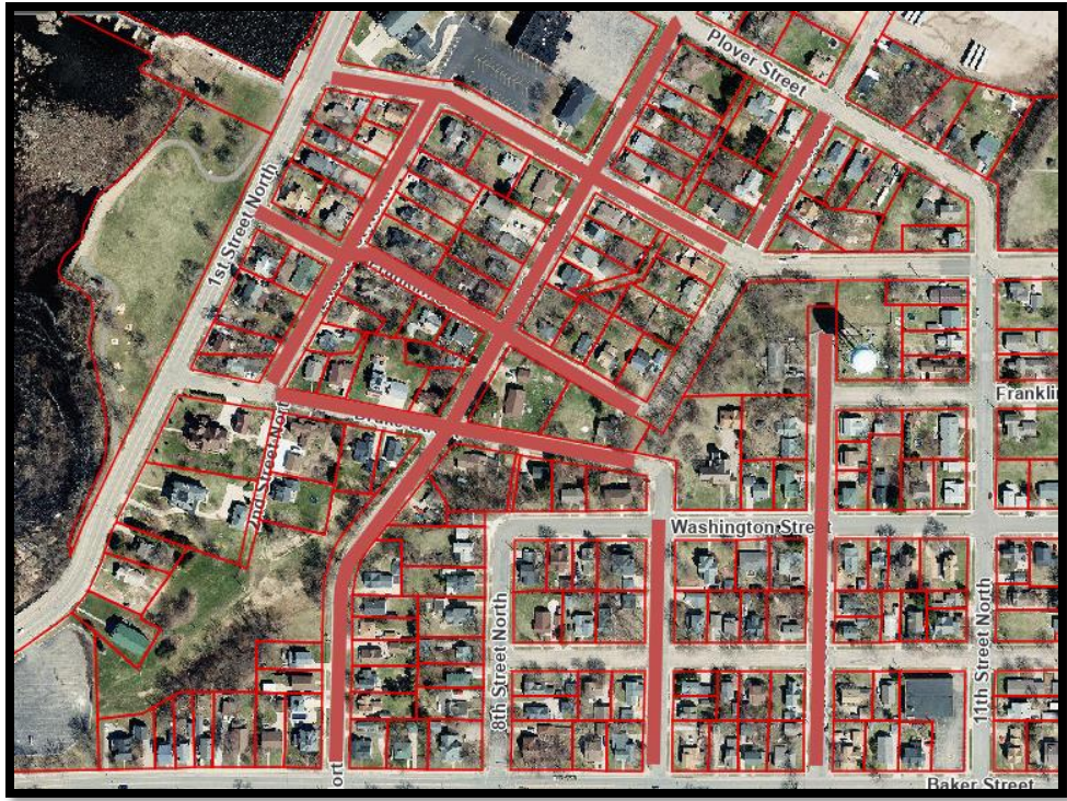
2024 Curb Maintenance Area