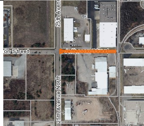
Jefferson St (25th Ave N to 758' East)

The section of Jefferson St from 25th Ave N to 758' east of the intersection was previously constructed in 1979. The pavement structure is at its end of life. The asphalt pavement is no longer flexible, settling and rutting are evident. New curb and gutter will be installed. Also a new cul-de-sac will be built at the east end of the street.