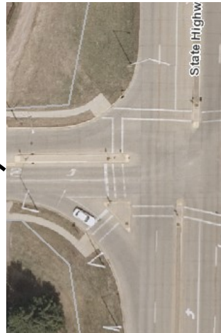
Chestnut St. & STH