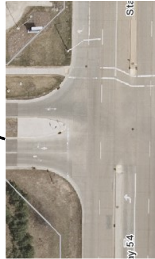
Peach St. & STH 54