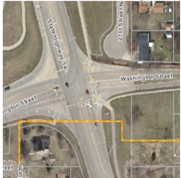
Washington St. & STH 54