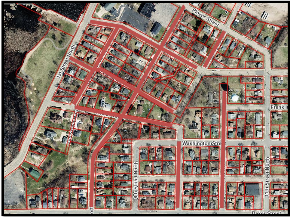
2024 Curb Maintenance Area