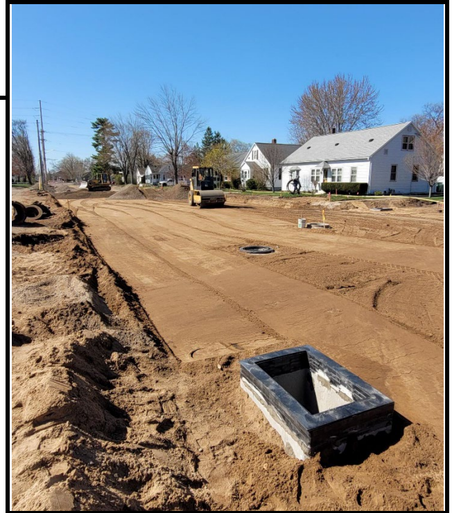
Lincoln Street at D Street