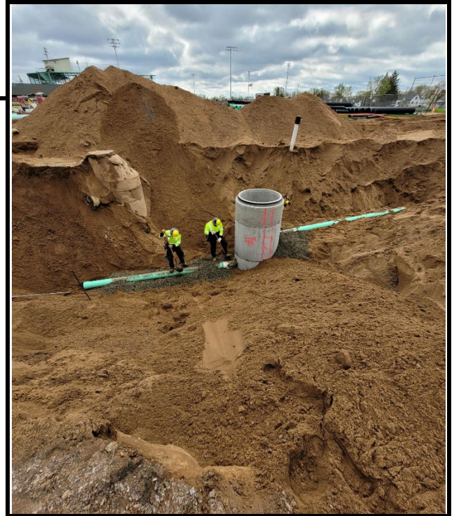
Lincoln Street near Witter Street