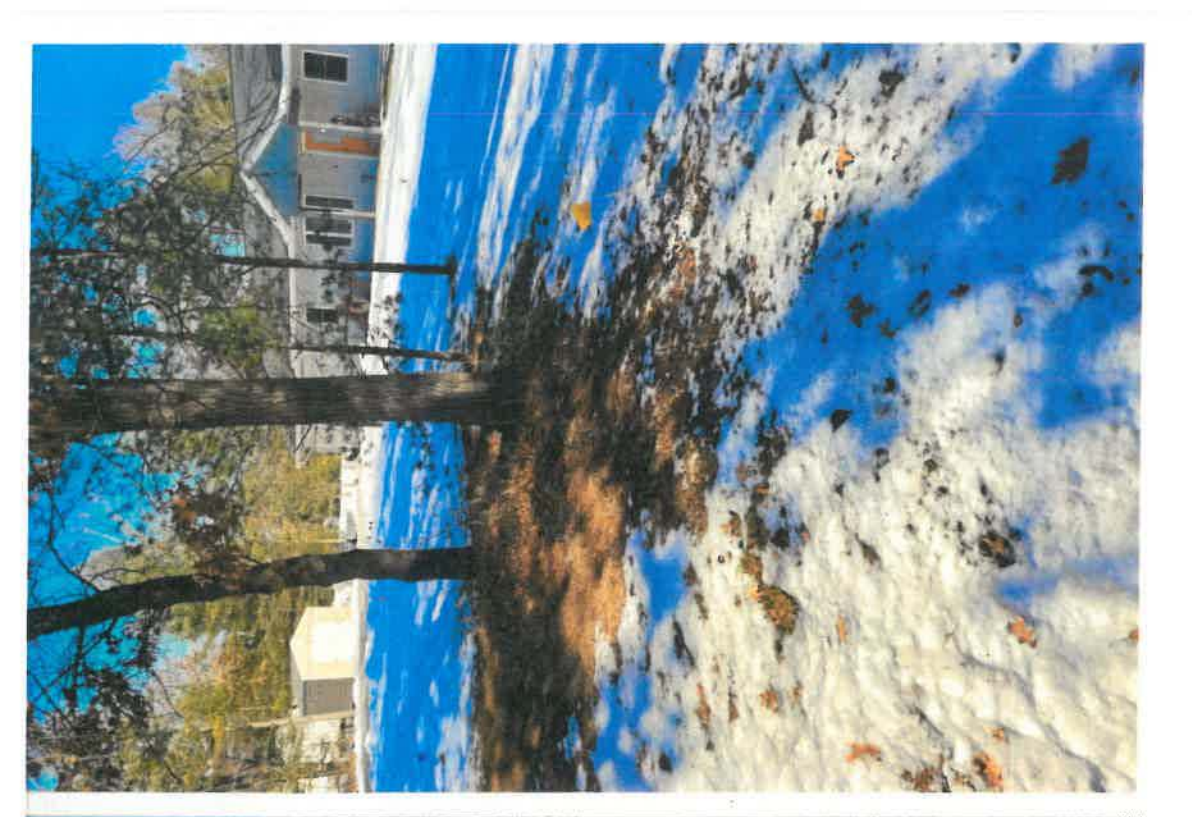
Page 17 of 20